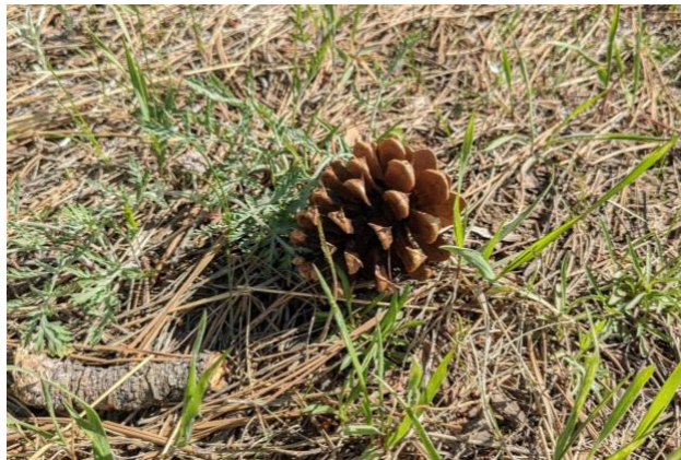
RATTLESNAKE (TOP LEFT) BIRD (TOP RIGHT) DEER (BOTTOM LEFT) PINECONE (BOTTOM RIGHT)