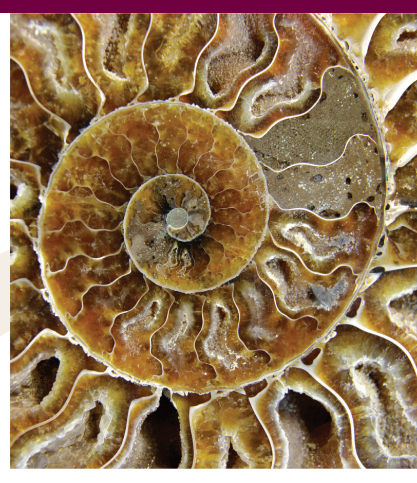
A fossil of an ammonite, an extinct ocean-living mollusk related to the modern nautilus. Ammonites evolved about 400 million years ago and were plentiful in the ocean until the occurrence of a global mass extinction > 65 million years ago that correlates with an asteroid impact.