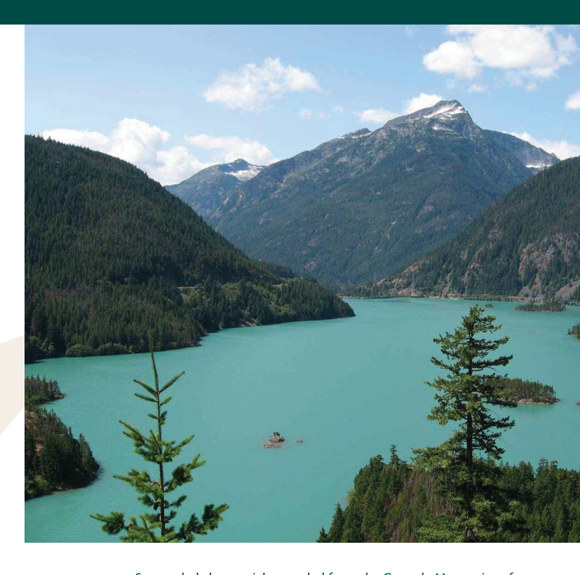
Suspended clay particles, eroded from the Cascade Mountains of Washington State, give Lake Diablo its brilliant color. The active volcanoes of the Cascades result from the subduction of the Juan de Fuca plate beneath North America.