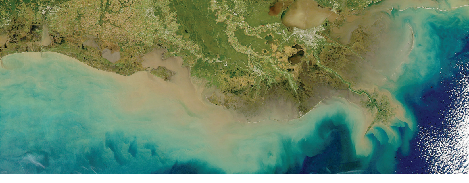
Louisiana coast with suspended sediments and organic matter flowing out of the Mississippi and other regional river systems into the Gulf of Mexico