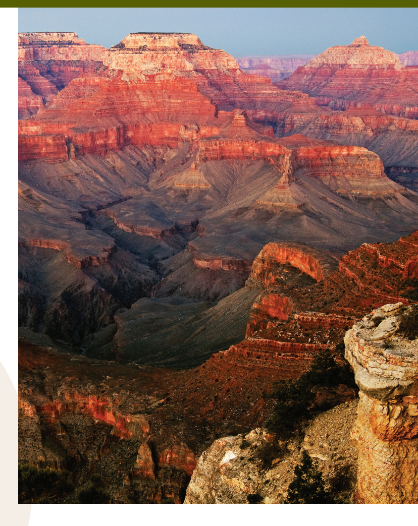
The Grand Canyon represents one of the most awe-inspiring landscapes in the United States. At the deepest parts of the canyon, nearly two-billion-year-old metamorphic rock is exposed. The Colorado River has cut through layers of colorful sedimentary rock as the Colorado Plateau has uplifted.