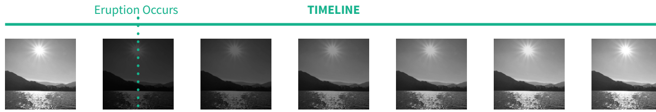
Amount of volcanic debris in atmosphere

How does a large volcanic eruption affect the atmosphere? How does debris in the atmosphere affect temperature on our planet? Create graphs below to estimate the change to the atmosphere and temperature. Use the illustrations of the Sun to estimate the amount of debris in the atmosphere.