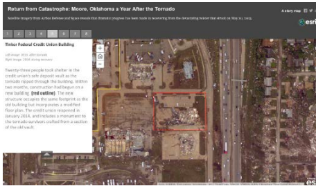
After the tornado, before recovery

To explore, you can zoom in and out, and move the map out by clicking on it, and move the gray bar to see the before and after images.