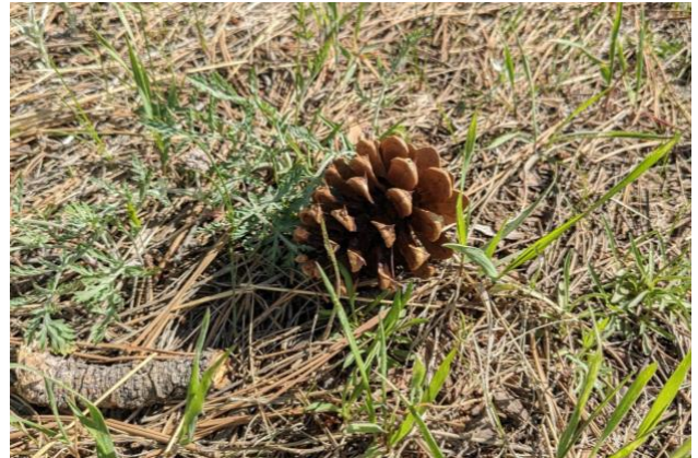
RATTLESNAKE (TOP LEFT) BIRD (TOP RIGHT) DEER (BOTTOM LEFT) PINECONE (BOTTOM RIGHT)