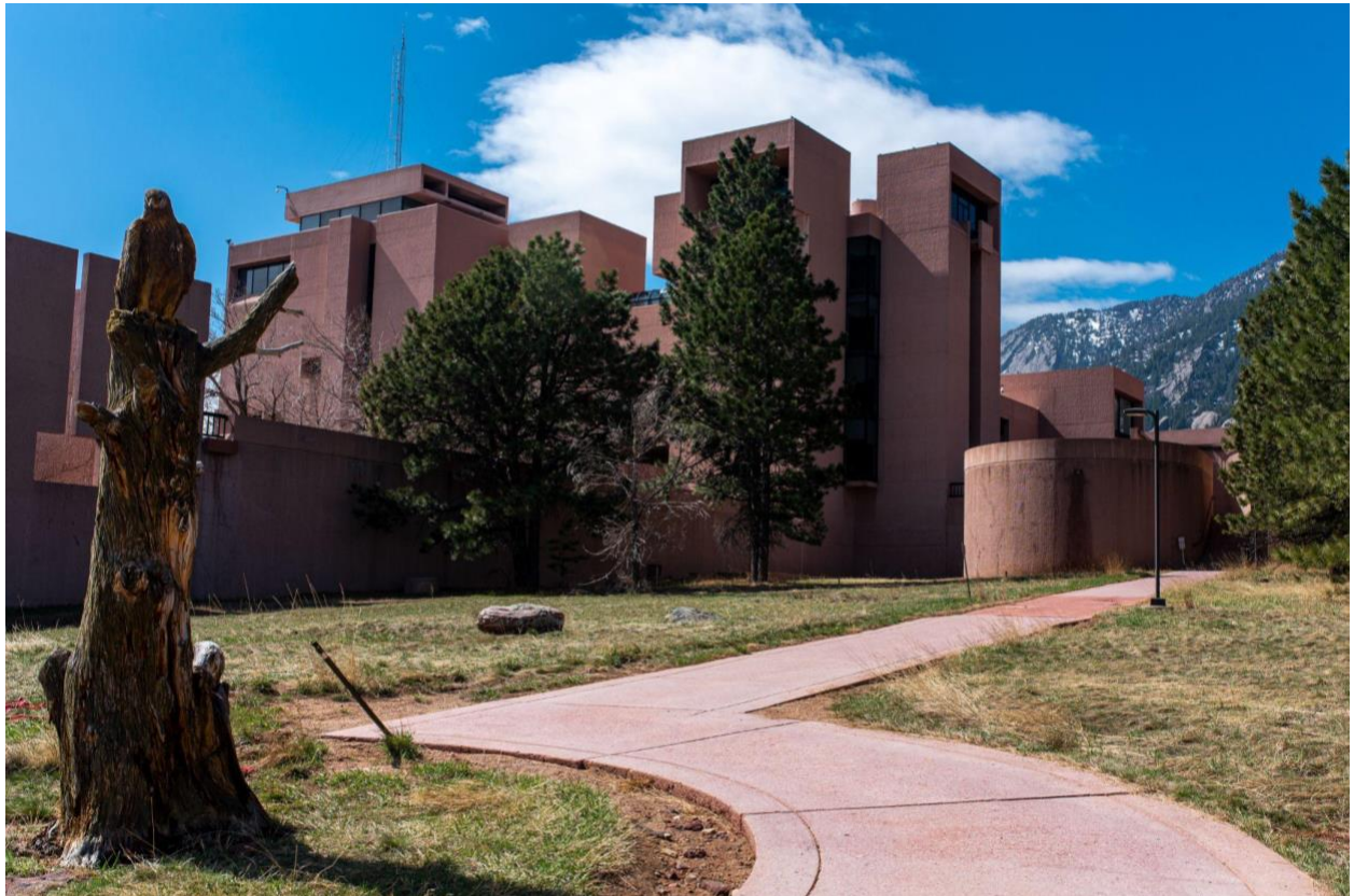
NSF NCAR MESA LAB FROM THE SIDEWALK

We are going to the U.S. National Science Foundation National Center for Atmospheric Research (NSF NCAR) Mesa Lab. We will learn about weather and our Earth system and have fun! We will see exhibits and do science activities. We will walk up a hill and some stairs to enter the building.