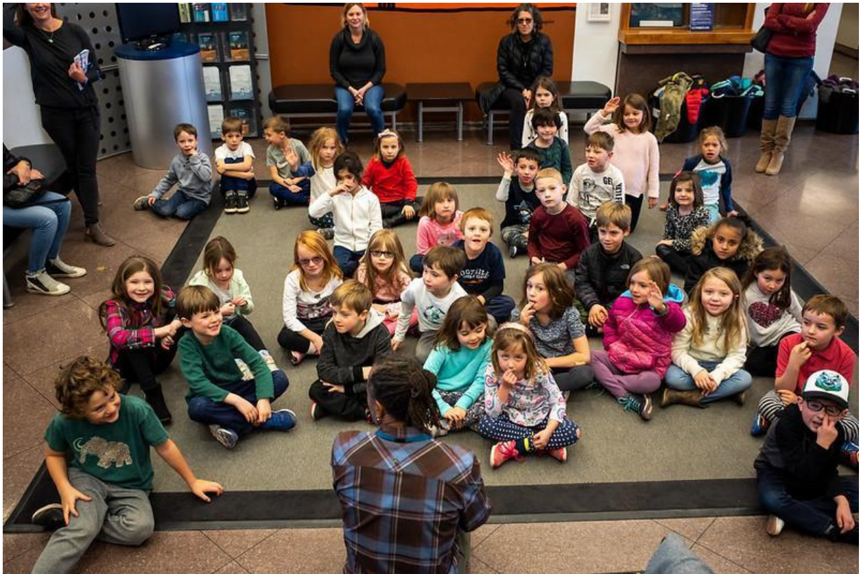
A CLASS GATHERED ON THE RUG IN THE LOBBY

Our guide will share important information for our visit.