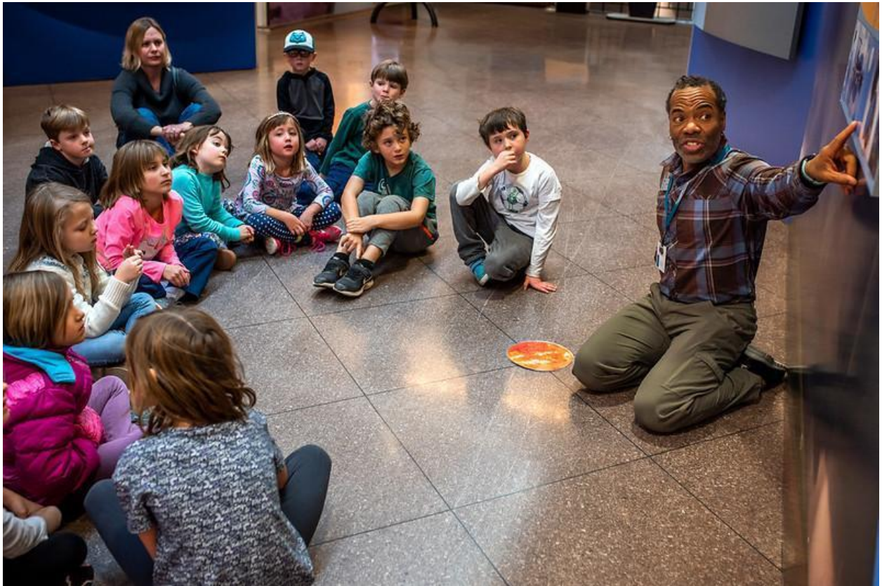
A GUIDE TEACHES STUDENTS ABOUT WEATHER AND THE EARTH SYSTEM

Our guide will take us around the exhibits and have a conversation about what we see. We will learn about weather and the Earth system. We can ask questions and be curious!