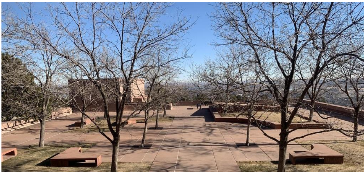
CAFETERIA (ABOVE) TREE PLAZA (BELOW)