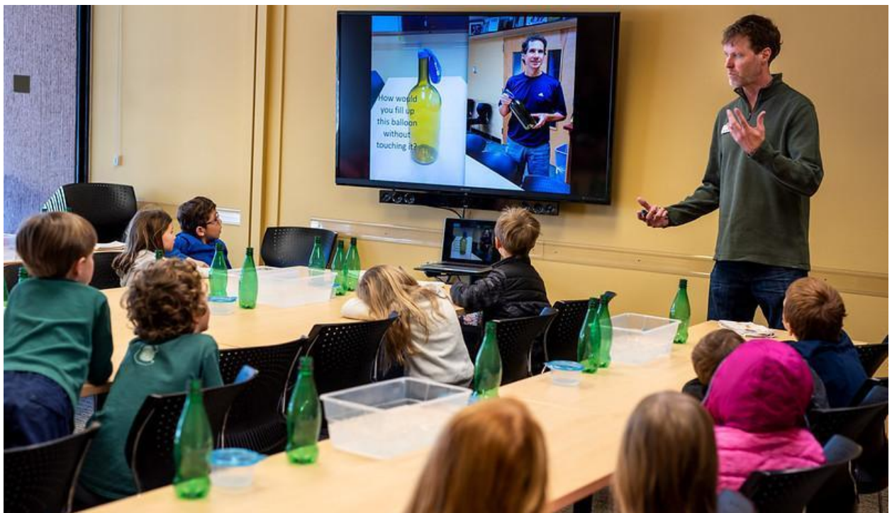
STUDENTS DOING AN ACTIVITY (ABOVE) GUIDE EXPLAINING AN ACTIVITY TO A CLASS (BELOW)