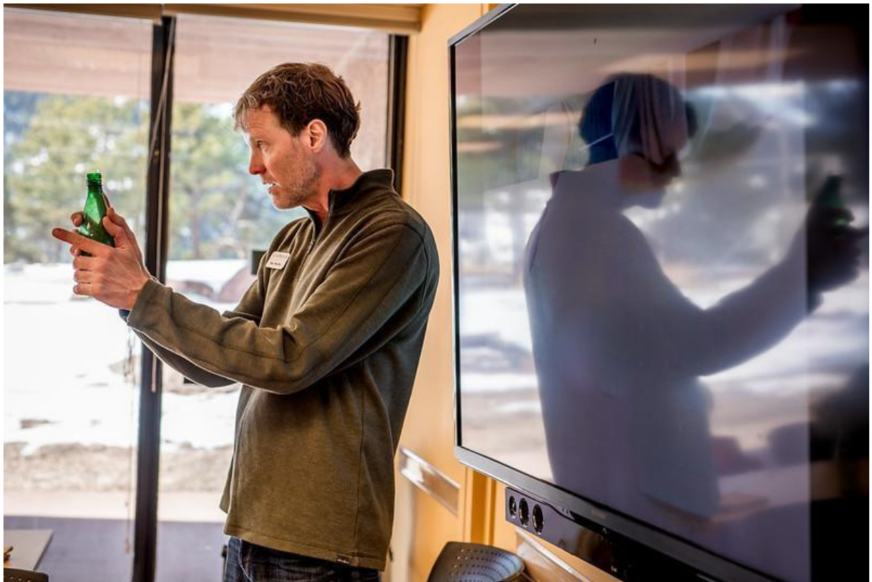
A GUIDE DEMONSTRATING AN ACTIVITY

We will go to the classroom to learn more about weather and the Earth system. A guide will show us an activity. The activity will happen either in the classroom or outside on the Weather Trail.