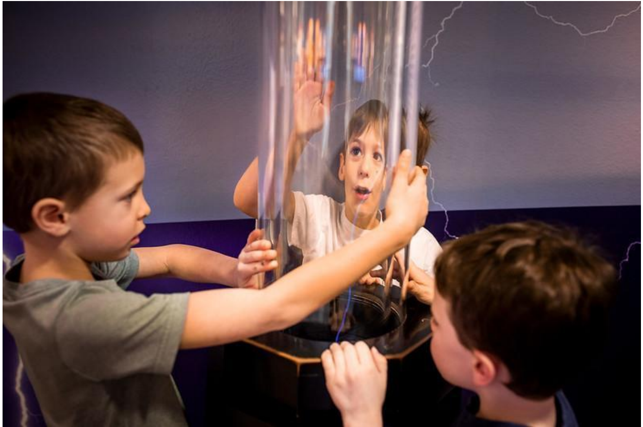
STUDENTS TOUCH AN EXHIBIT ABOUT WEATHER

I will be able to explore the exhibits with my group. Our guide might give us something to look for. We can touch the exhibits. Some of the exhibits have games we can play. This is a great time to explore!