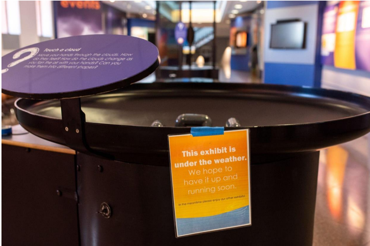
SIGN ON A BROKEN EXHIBIT

Sometimes an exhibit will be broken. When an exhibit is being fixed, we will not be able to use it. It is okay to feel disappointed if something is broken. We can visit a different exhibit!