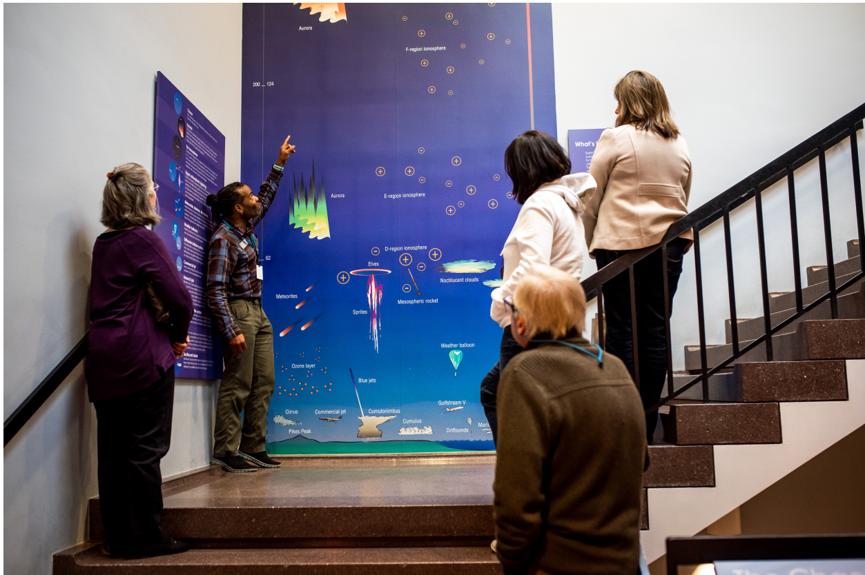
GUIDE GIVING A TOUR OF THE EXHIBITS

The guide will take us around the exhibits and have a conversation about what we see. We will learn about weather and our Earth system. I can be curious and raise my hand to ask questions at any time.