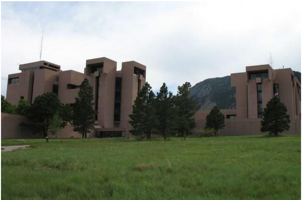
NSF NCAR MESA LAB FROM THE PARKING LOT