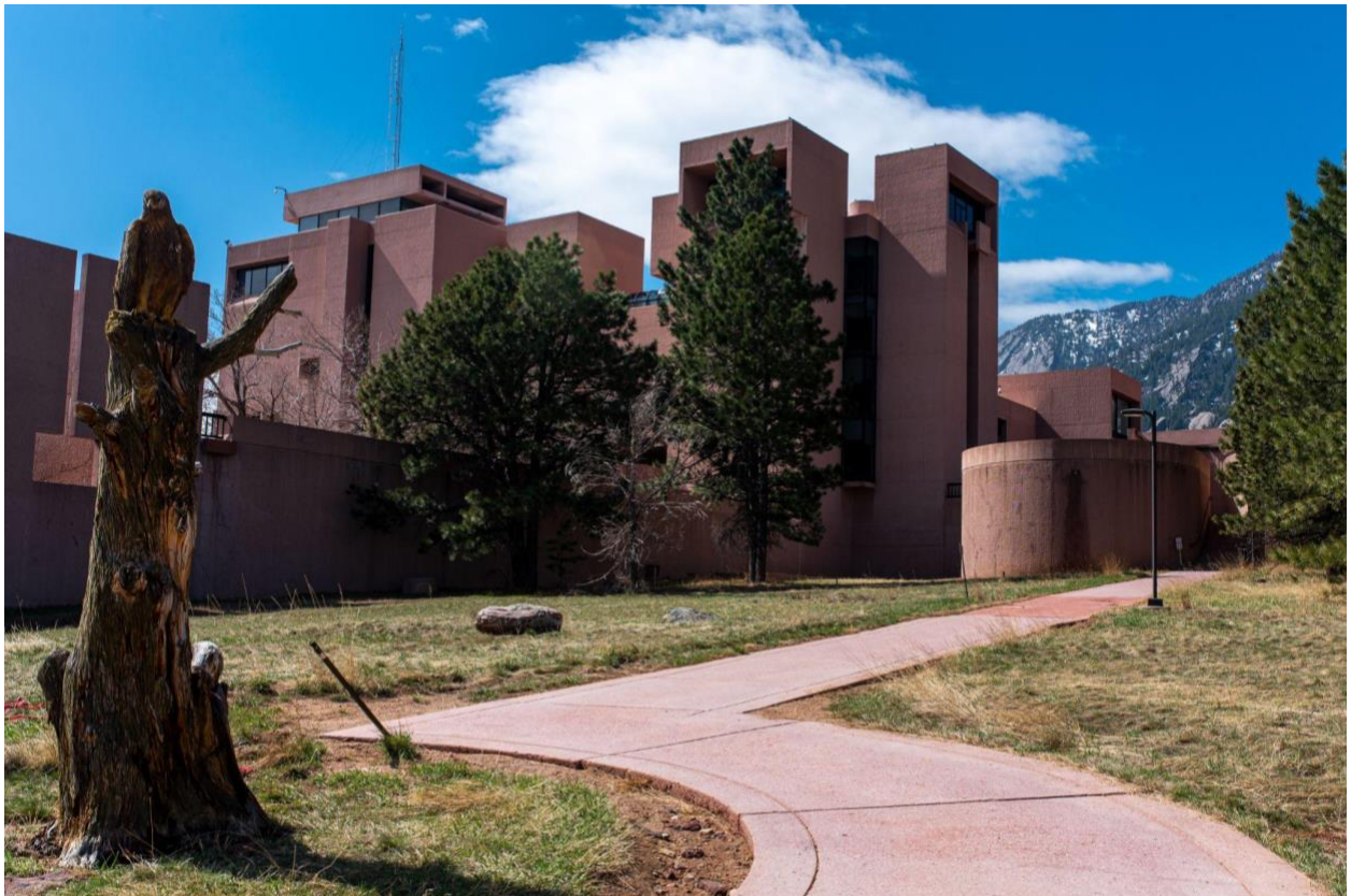
NSF NCAR MESA LAB FROM THE SIDEWALK

I am going to the U.S. National Science Foundation National Center for Atmospheric Research (NSF NCAR) Mesa Lab. I will learn about weather and our Earth system. I can see exhibits and go hiking. I will walk up a hill and some stairs to enter the building.