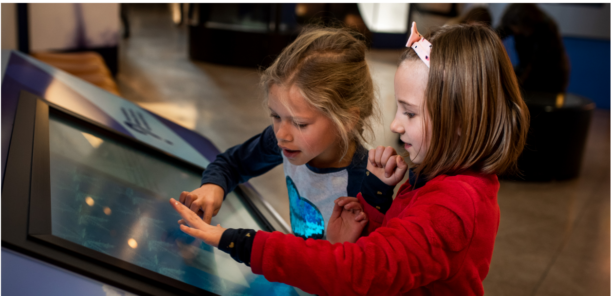
WEATHER EXHIBIT (ABOVE) GAME IN THE EXHIBITS (BELOW)