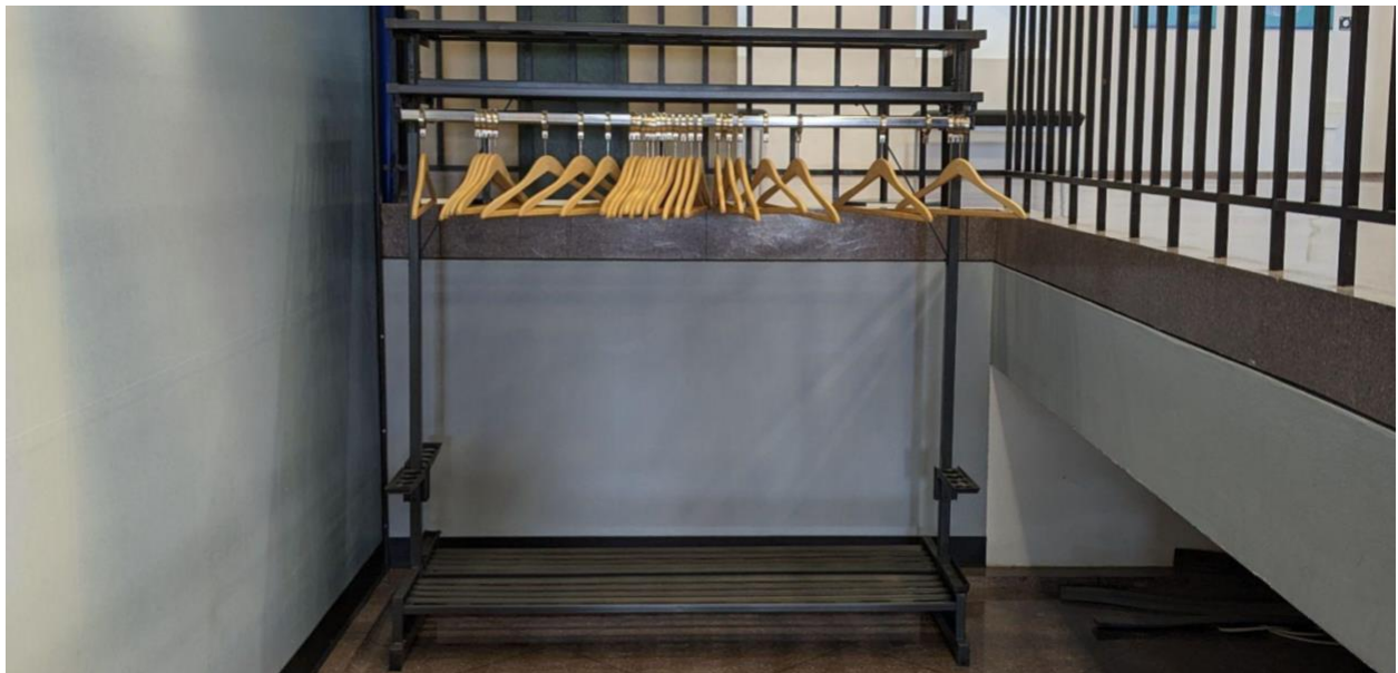
RECEPTIONIST IN THE LOBBY (ABOVE) COAT RACK (BELOW)