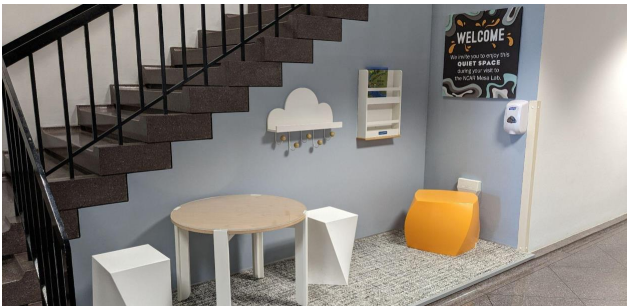
NSF NCAR LIBRARY (ABOVE, CLOSED ON WEEKENDS) QUIET SPACE NEAR CLASSROOM 135 (BELOW)