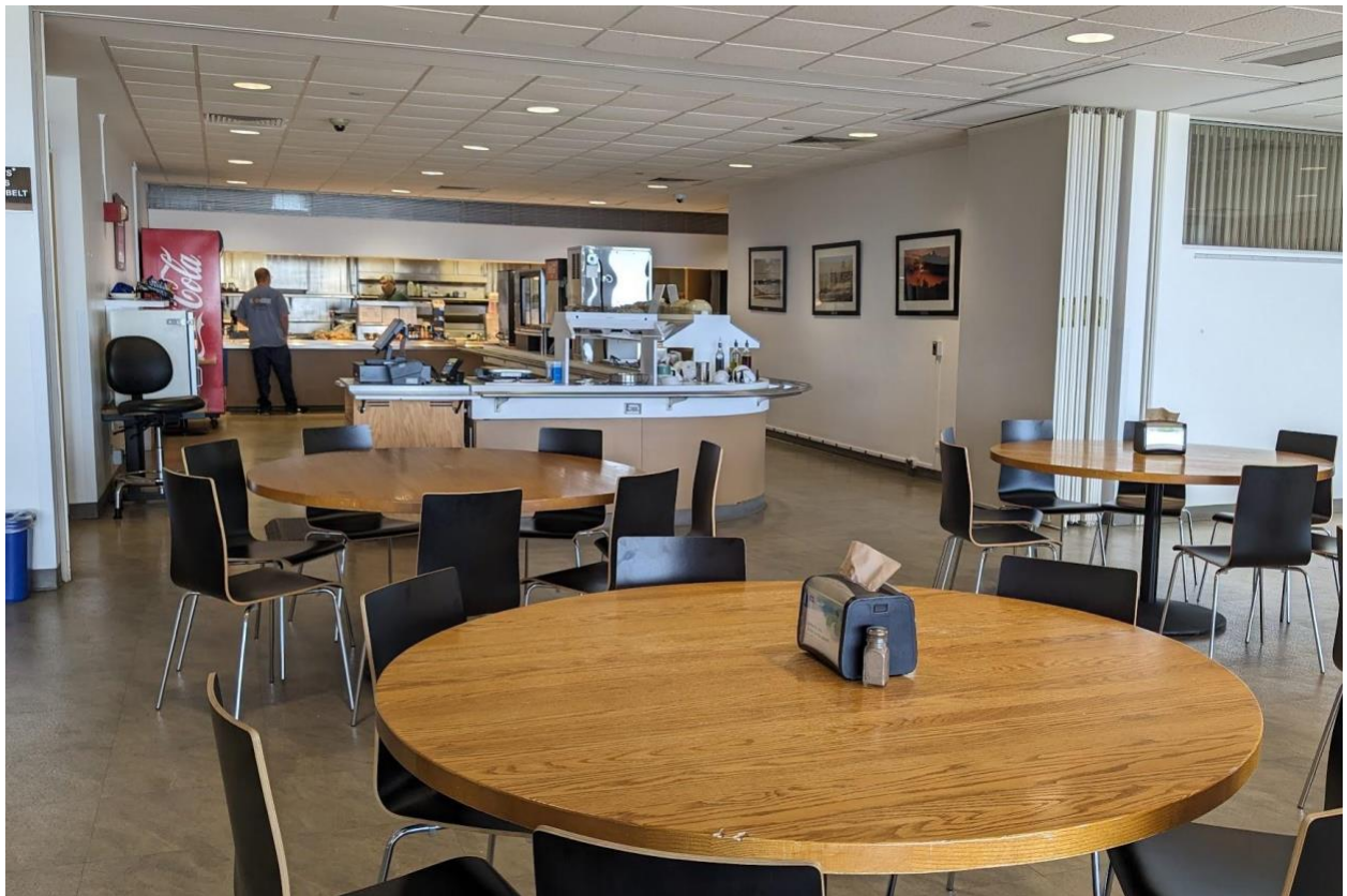
NSF NCAR CAFETERIA

The cafeteria might be noisy. If I need to go somewhere quiet, I will ask for help at the front desk.