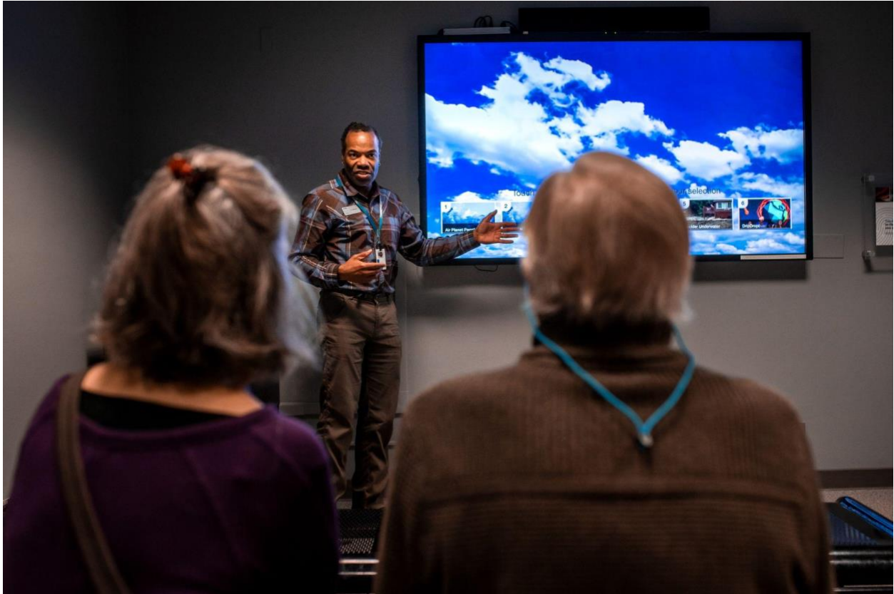
A MOVIE IN THE NSF NCAR THEATER

I can go to the theater to watch a movie. There might be parts of the movie that are loud. If it's too loud, I can leave the theater.