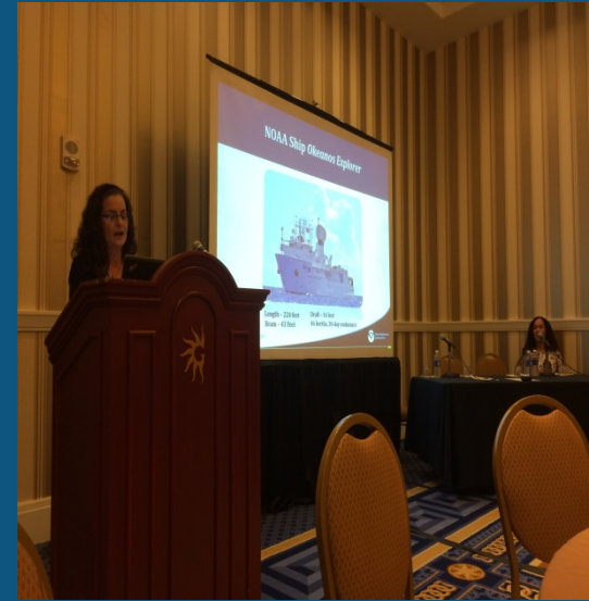
Ocean Science Talks